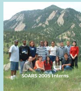
SOARS 2005 Interns

High Level Data Products for Education developed in UNAVCO's E&O projects will include a contextual framework for data, integrating various types of data, working with visualization, and be tailored for specific audiences